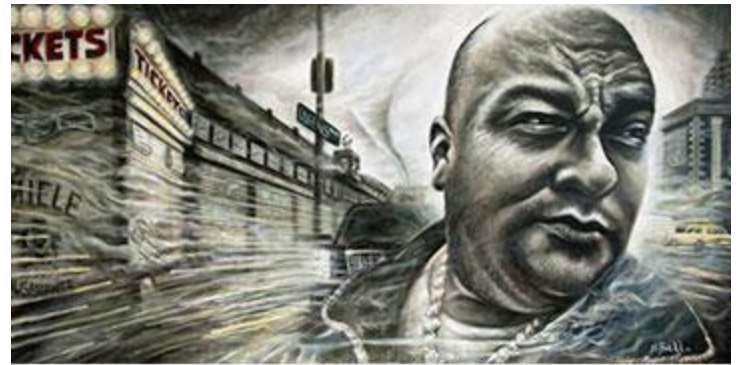
Boulevard of Broken Queens

WILLIAMSPORT, Pa. - The Lycoming College Art Department will host a juried alumni show from Sept. 15-Oct. 21 in the College's art gallery in Snowden Library. An artists' reception will be held Friday, Oct. 14, during Lycoming's Homecoming and Reunion Weekend from 4:30-6 p.m.