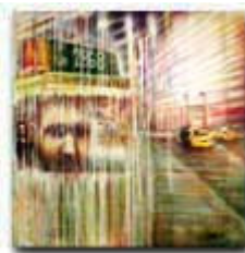
5. "Getaway Car" 60" X 60" oils/mixed-media/ linen