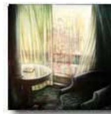
8. "Check In, Check Out" 60" X 60" oils/mixed-media/ linen