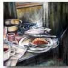
2. "Room Service" 60" X 60" oils/mixed-media/ linen