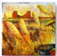
7. "The Meadows" 60" X 60" oils/mixed-media/ linen