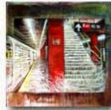
3. "The Ring" 60" X 60" oils/mixed-media/ linen