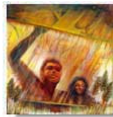
6. "Unfinished Business" 60" X 60" oils/mixed-media/ linen