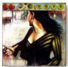
4. "Never Look Back" 60" X 60" oils/mixed-media/ linen