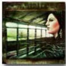
1. "The Transfer" 60" X 60" oils/mixed-media/ linen

Below is the portfolio of representative pieces. Venue will insure items while in their possession. Click to view larger or online at: http://mbellart.com/tickettoride.html