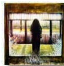
9. "The N and the R" 60" X 60" oils/mixed-media/ linen